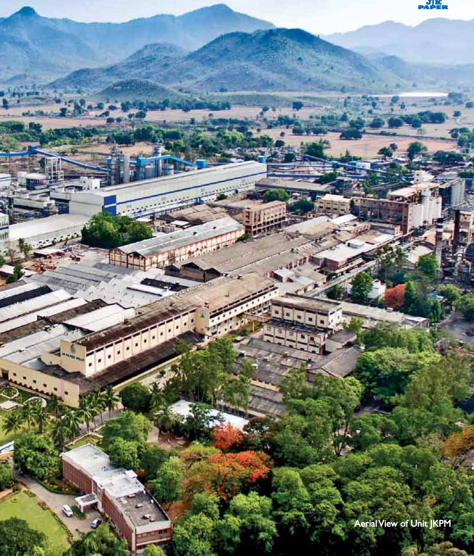
Aerial View of Unit JKPM